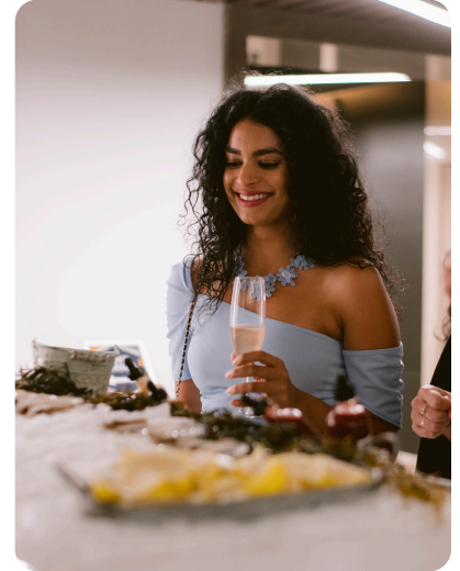
Evening Events/After Parties