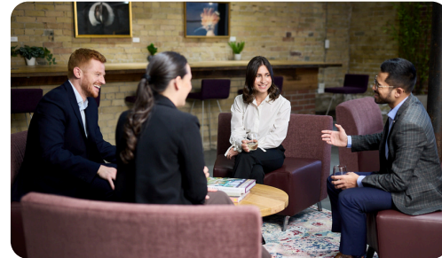
Corporate Holiday Parties