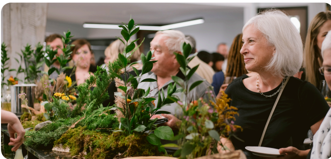
Weddings & Bridal Showers