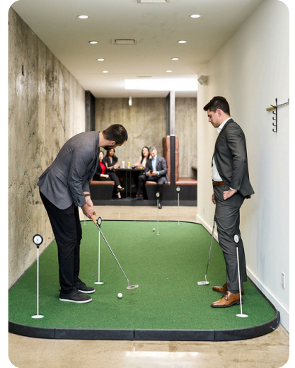
Evening Events/After Parties