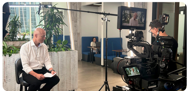
Photoshoots & Filming