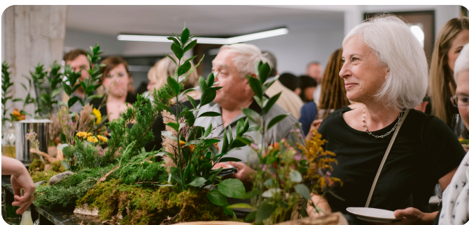
Weddings & Bridal Showers