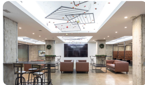
Corporate Holiday Parties